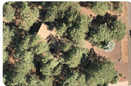
Example: Overgrown Vegetation