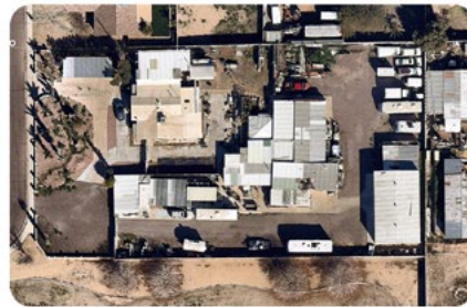
Example: Business Activities