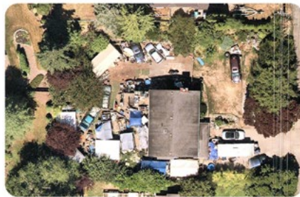
Example: Lot Debris