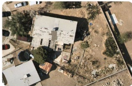
Example: Roof Damage